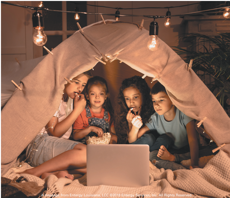
A message from Entergy Louisiana, LCC ©2018 Entergy Services, Inc. All Rights Reserved.